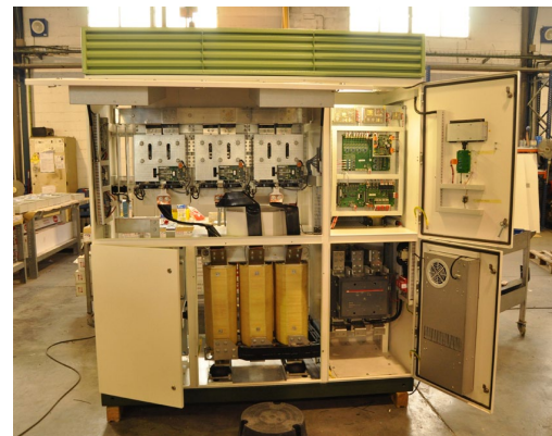
GP Tech's PV WD inverters and BCPS WD have achieved the cULus Certification Mark