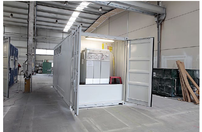
GP Tech's APIS indoor covering tests for the cULus certification

PV500WD, PV630WD, BCPS500WD and BCPS630WD models have also achieved the cULus Certification Mark, which indicates compliance with both Canadian and US requirements. cULus requires the same tests as those demanded by UL Certification and includes an additional engineering rationale and representative testing for anti-islanding tests.